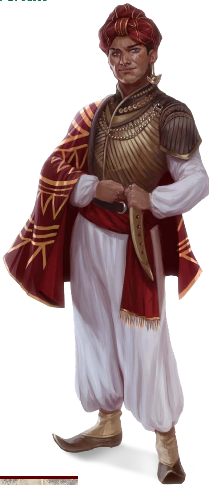
ESMAYL IBN QARADI